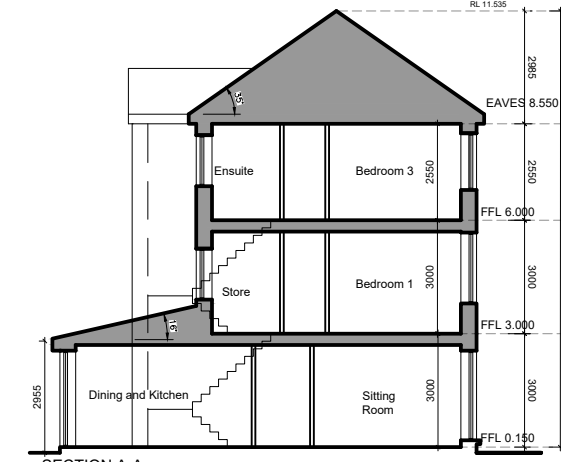
SECTION A-A 1:200